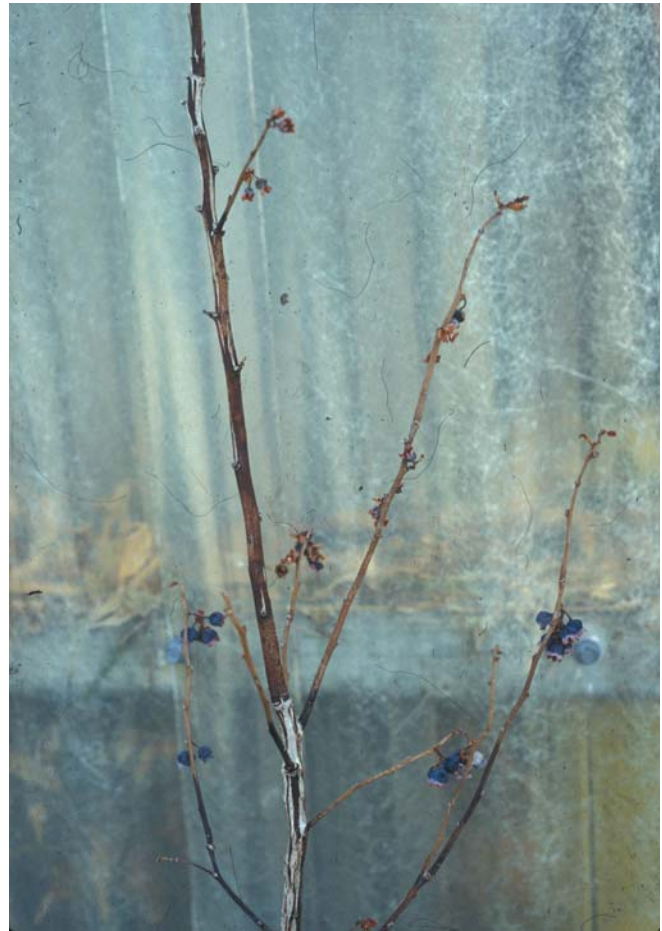
Figure 3. Young blueberry plant with blueberry stem blight caused by stress associated with fruit set without leaves.

Summer topping. In Florida, summer topping is used to stimulate vegetative growth of bearing southern highbush and should be done soon after harvest, usually during June (Fig. 4). Plants should be fertilized the week before pruning so they will