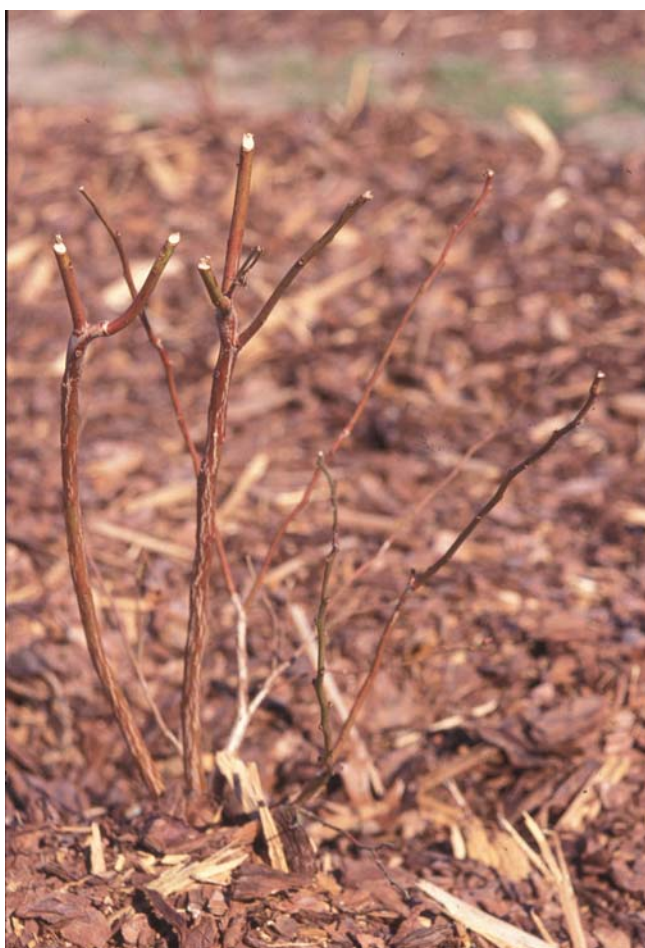
Figure 1. A young blueberry plant pruned back to about 50% to 65% of its original size at transplanting from the nursery to the field.

Dormant pruning. Annual dormant pruning of highbush blueberry plants is needed to prevent overbearing, maintain plant vigor, and enhance fruit quality and earliness. Dormant pruning should begin