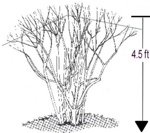
Figure 4. Southern highbush blueberry plants are topped in the summer soon after harvest to stimulate strong vegetative growth during the remainder of the growing season.