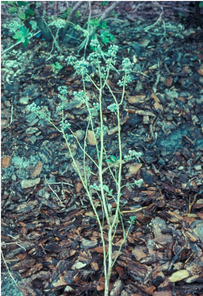
Figure 2. Young 'Misty' plant with heavy fruit set and few leaves with probably die from blueberry stem blight before the end of the growing season.

and lose their vigor and productivity. When blueberry plants are between 5 and 6 years old, removal of some of the older canes should begin. This will stimulate the development of new, productive, canes. Each year, thinning cuts are used to remove approximately 25% of the oldest canes by cutting them back to strong laterals or close to the ground. Regular cane renewal pruning allows for constant long-term productivity with bushes that contain a mixture of canes of different ages. As plants age, a combination of thinning cuts and heading back cuts will be needed to meet the objectives of cane renewal, fruit load adjustment, maintenance of vigor, and proper plant size and shape.