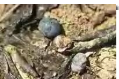
Blueberry fruit infection. Note shriveled fruit on the ground. It is important to remove fallen leaves and mummies to prevent spore spread the following year.