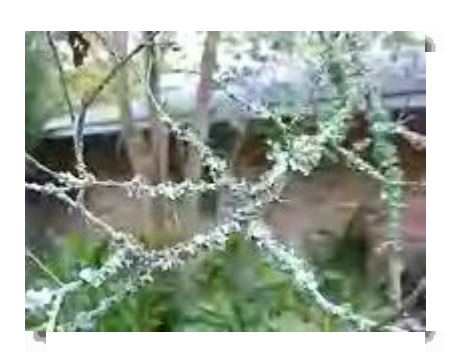
Lichens on blueberry. Lichens are nonparasitic organisms and do not injure